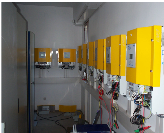
Fig.1: „HYBRIX“ pilot installation

Results from laboratory tests and experience from the first pilot installation „HYBRIX“ (San Agustin del Guadalix, Spain), consisting of three clusters of three single phase inverters, will be presented.